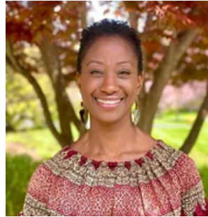
TSITSI SITHOLE U.N. SPECIAL REP, NEW YORK